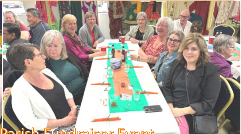
Taste of India Dinner - Parish Fundraiser Event